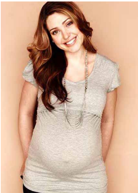
quack puffy nursing top - grey pk0016