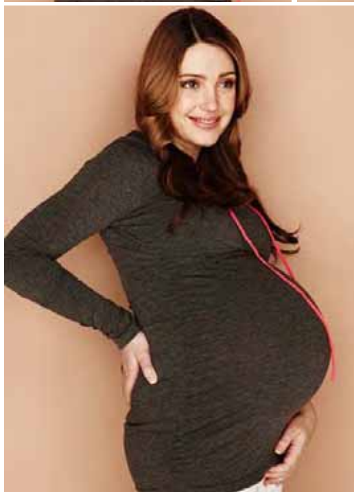
quack nursing hoodie - charcoal w pink/navy ties pk0019