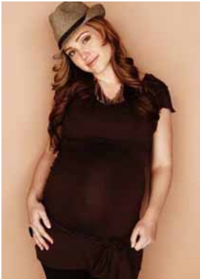
quack band tunic - brown pk0013