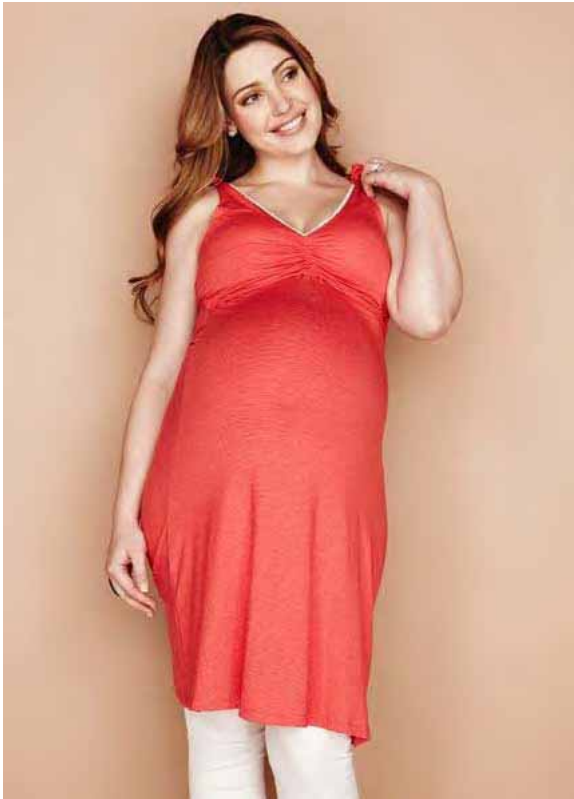
quack french nursing dress - coral stripes, black/grey stripes pk0021