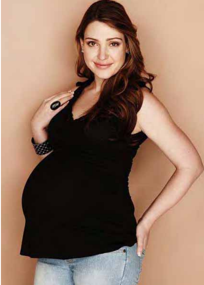
quack lacy nursing cami - black pk0020