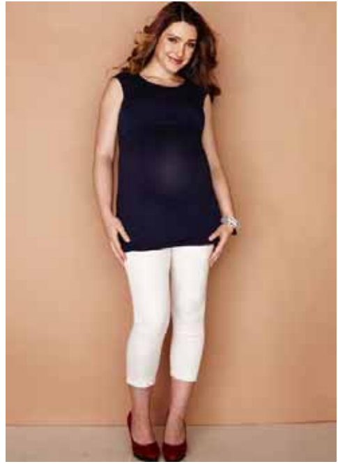
quack cap sleeve nursing top - navy, black, grey pk0011