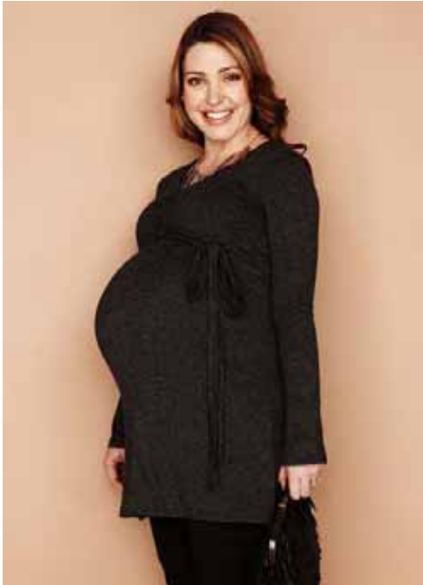
quack nursing dress - black/grey stripes, solid brown pk0017