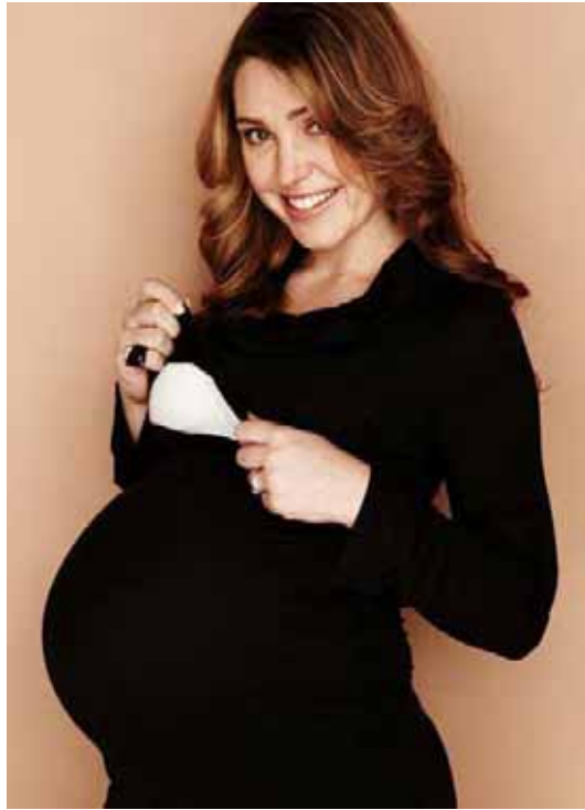
quack cowl neck nursing top - black pk0018