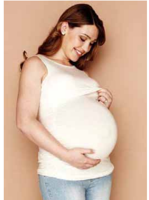
quack nursing tank -- creme, black, khaki pk0010